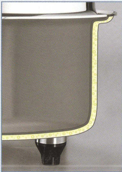
Oil Core 5 quart Slow Cooker

Goes from kitchen to table for serving convenience.