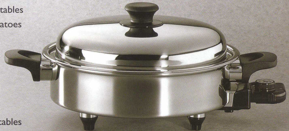
Oil Core Electric Skillet